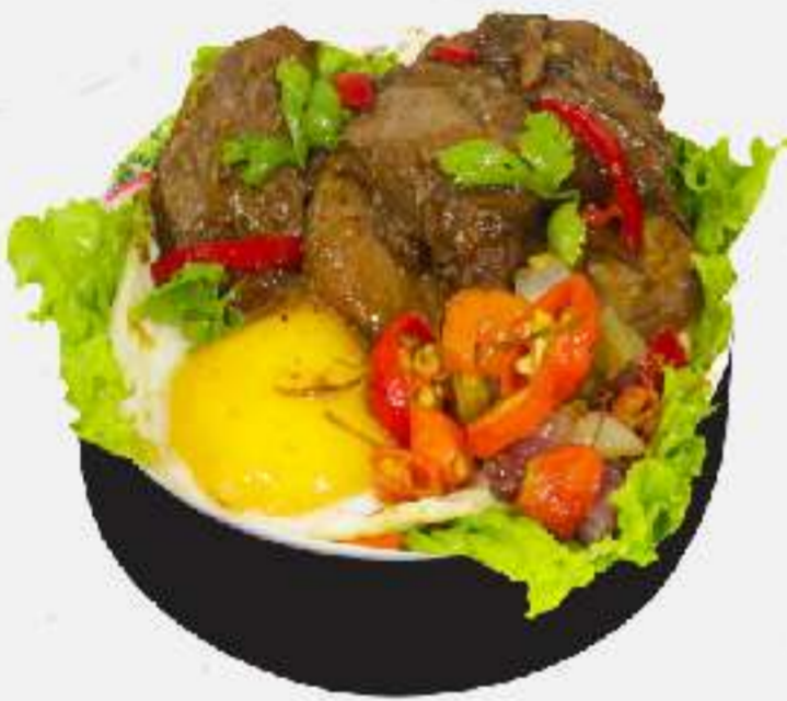
AYAM BUMBU BALI Rp.39.000