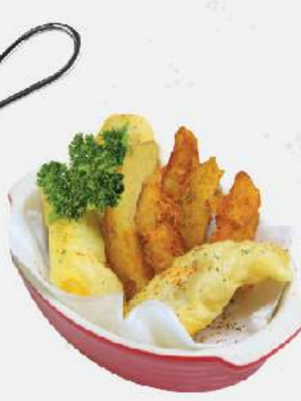
FISH & CHIP Rp.22.000