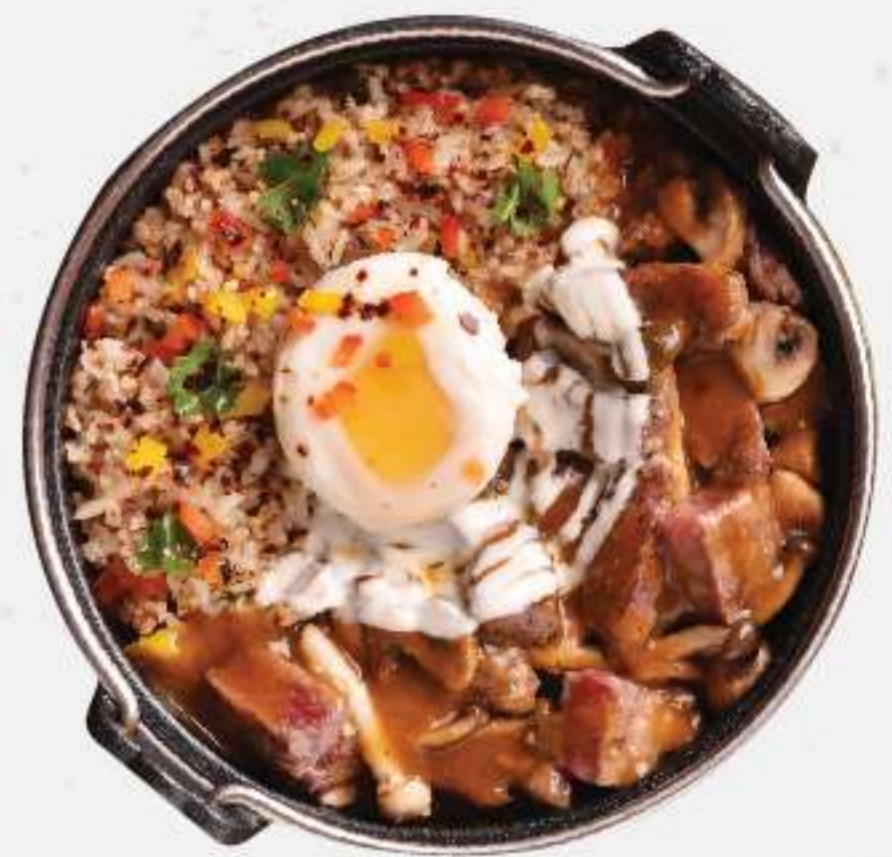
HOKUBEE BEEF Rp.79.000