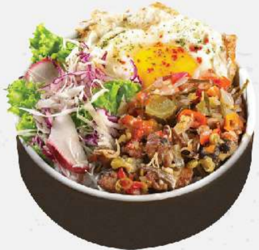
SPICY TUNA Rp.39.000