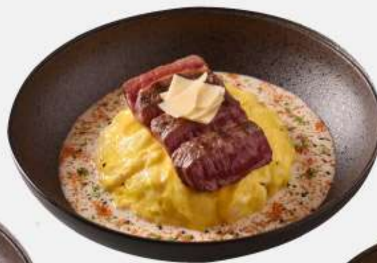
HOKUBEE BEEF Rp.89.000