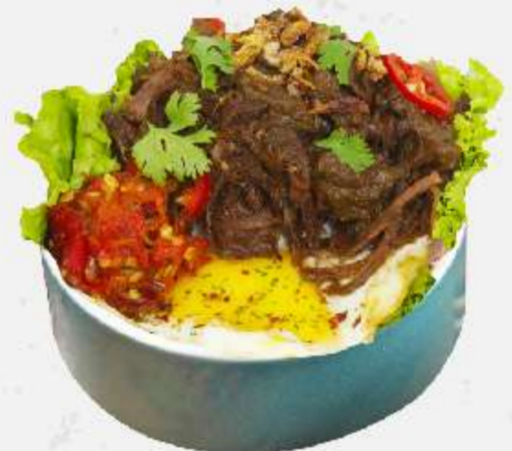
BEEF RENDANG Rp.45.000

CHOOSE YOUR LEVEL OF SPICENESS : ♪ LEVEL 1 ♪♪ LEVEL 2 ♪♪♪ LEVEL 3 ♪♪♪♪ LEVEL 4 ♪♪♪♪♪ LEVEL 5