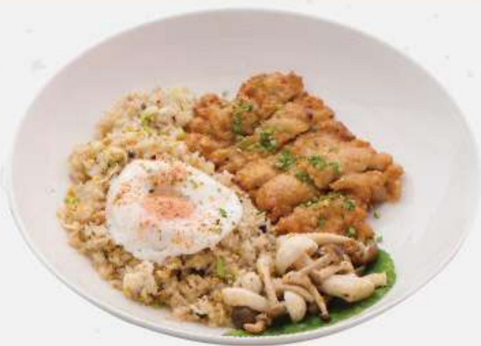
🍷 BUTTERMILK FRIED CHICKEN Rp.65.000