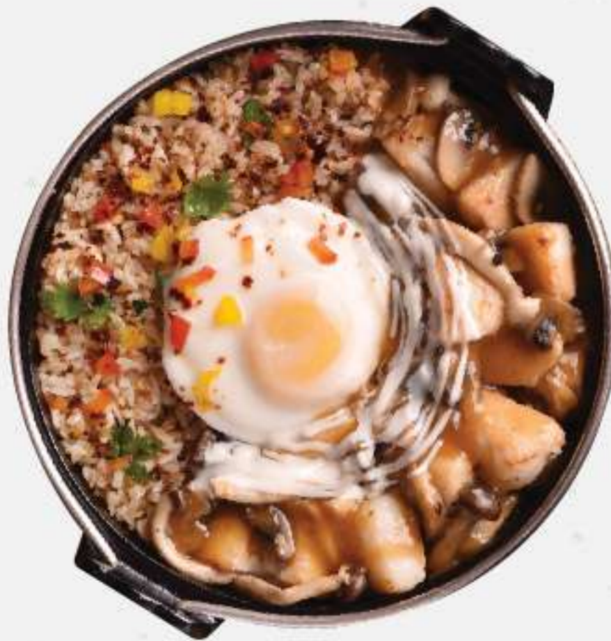
🍷 DORI Rp.69.000