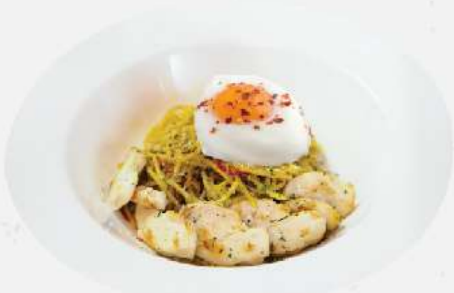
AGLIO OLIO CHICKEN 59.000