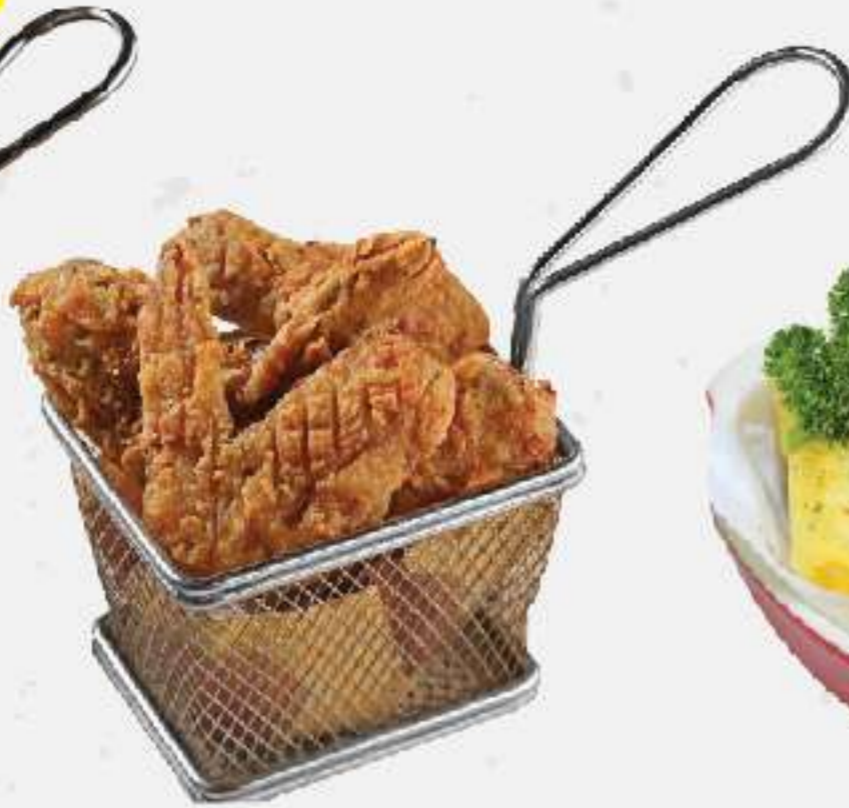
HONEY GARLIC WINGS Rp.27.000