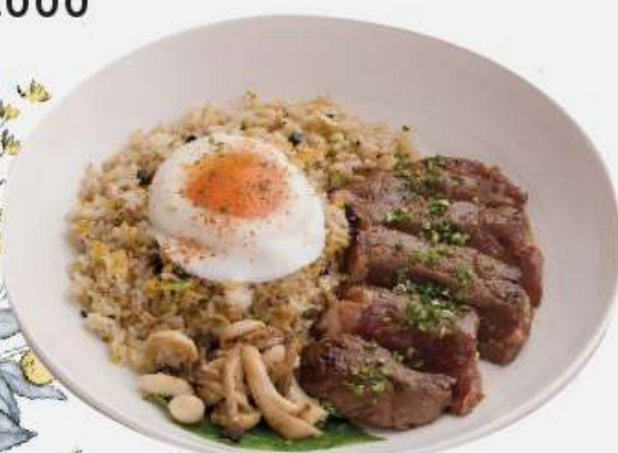
🍷 HOKUBEE BEEF WITH TERIYAKI SAUCE Rp.89.000