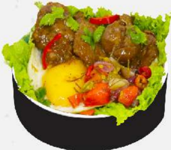
CHICKEN THAI Rp.39.000