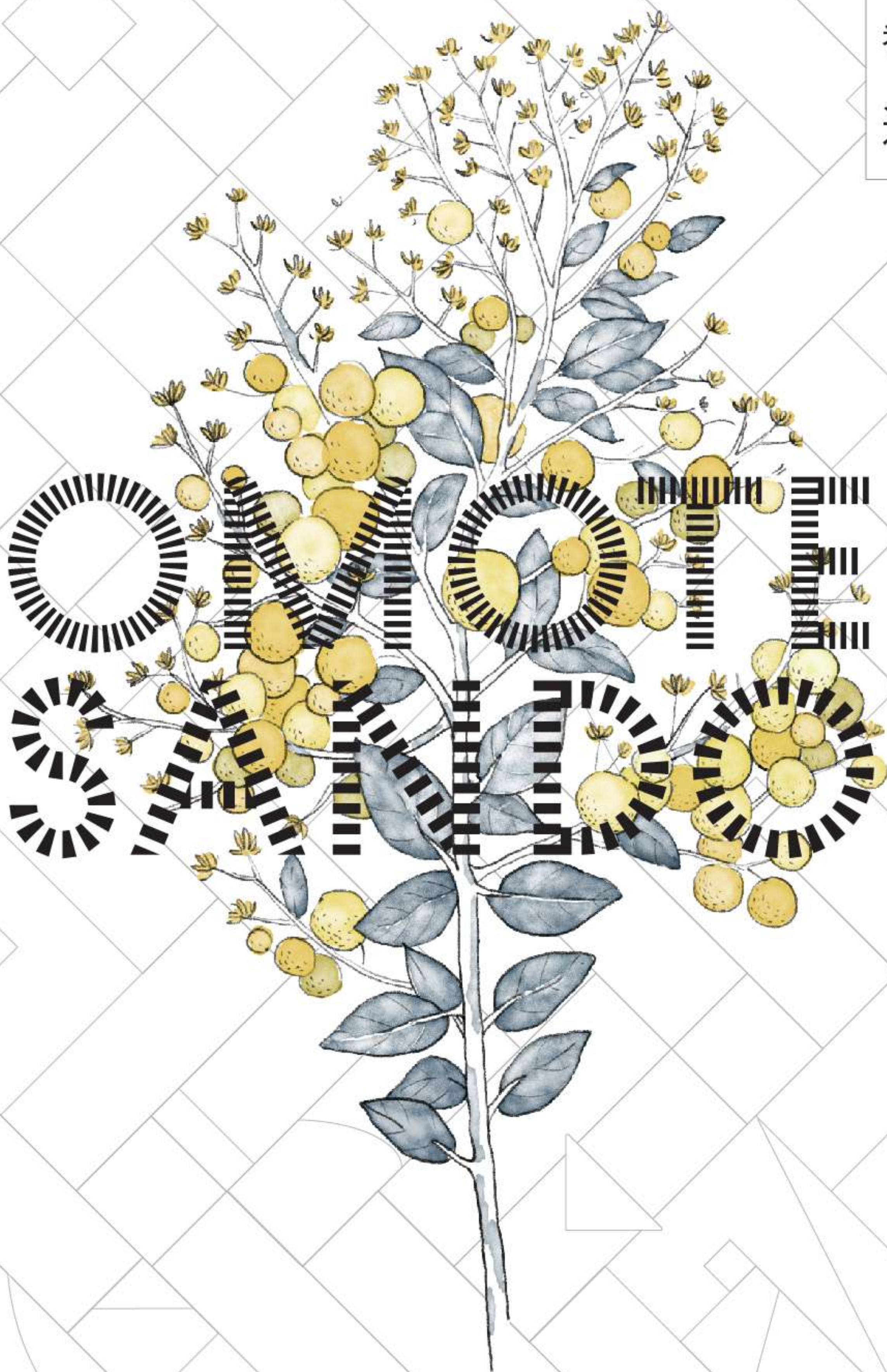
表 参 道