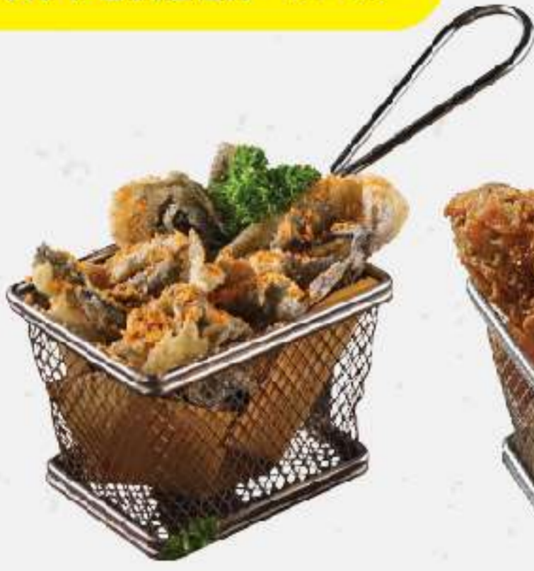
🍷 SHIOZUKE DORI Rp.17.000