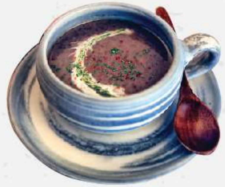
🍷 TRUFFLE SHIMEJI Rp.29.000