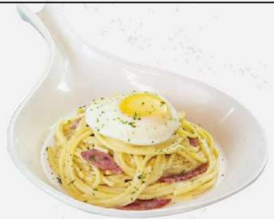
CARBONARA BACON & EGG 65.000