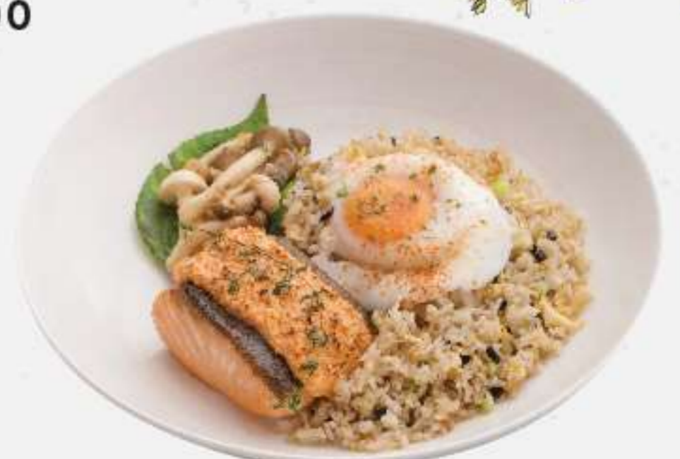
🍷 PAN SEARED SALMON WITH MENTAIKO Rp.89.000