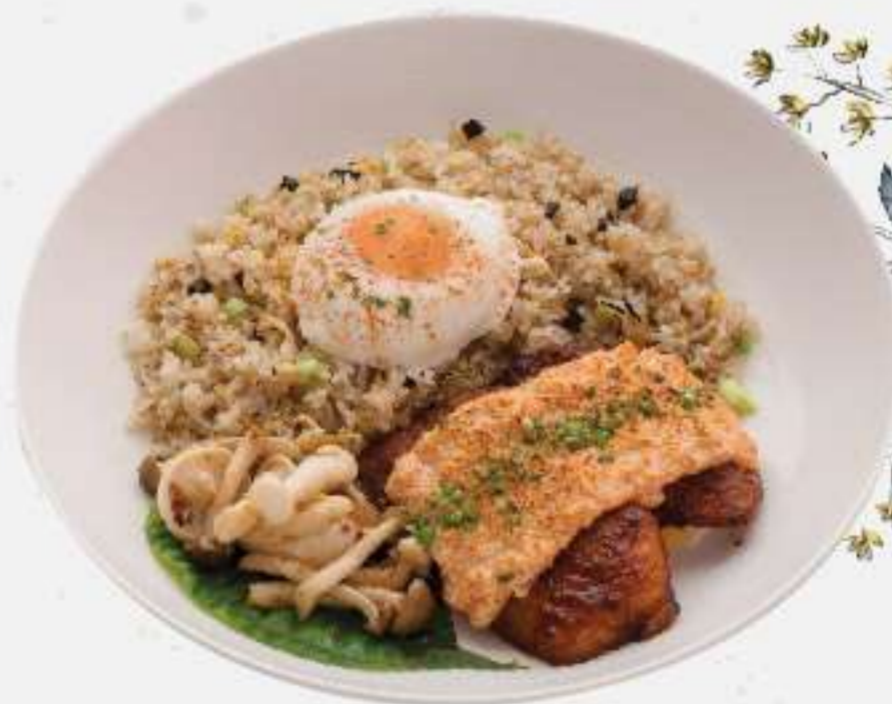
JOHN DORY WITH MENTAIKO SAUCE Rp.75.000