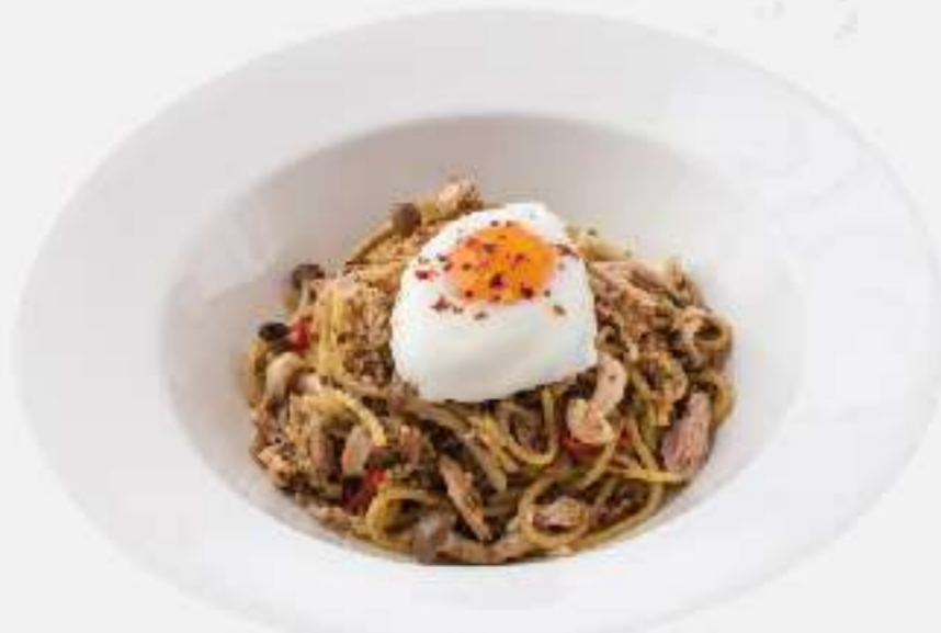
AGLIO OLIO TUNA 75.000